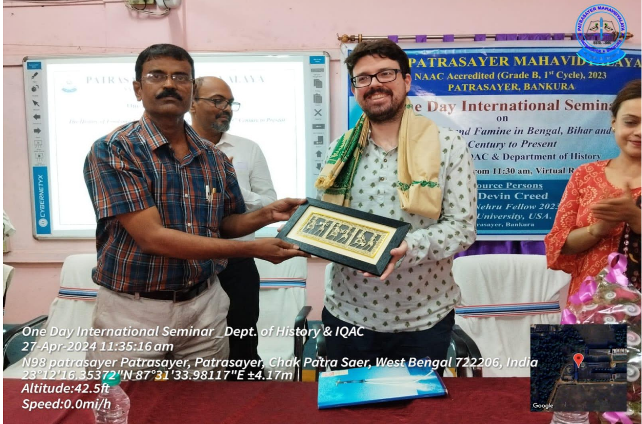
One Day International Seminar _Dept. of History & IQAC 27-Apr-2024 11:35:16 am N98 patrasayer Patrasayer, Patrasayer, Chak Patra Saer, West Bengal 722206, India 23°12'16.35372"N 87°31'33.98117"E ±4.17m Altitude:42.5ft Speed:0.0mi/h