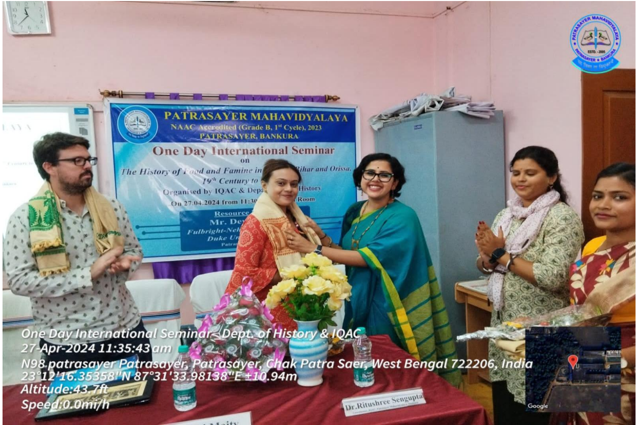
One Day International Seminar Dept. of History & IQAC 27-Apr-2024 11:35:43 am N98 patrasayer Patrasayer, Patrasayer, Chak Patra Saer, West Bengal 722206, India 23°12'16.35558"N 87°31'33.98138"E +10.94m Altitude:43.7ft Speed:0.0mi/h