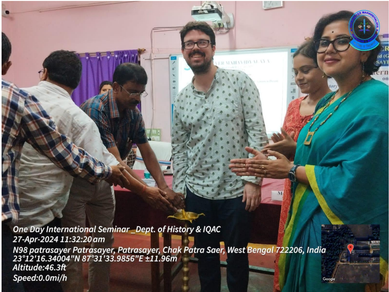
One Day International Seminar _Dept. of History & IQAC 27-Apr-2024 11:32:20 am N98 patrasayer Patrasayer, Patrasayer, Chak Patra Saer, West Bengal 722206, India 23°12'16.34004"N 87°31'33.9856"E ±11.96m Altitude:46.3ft Speed:0.0mi/h