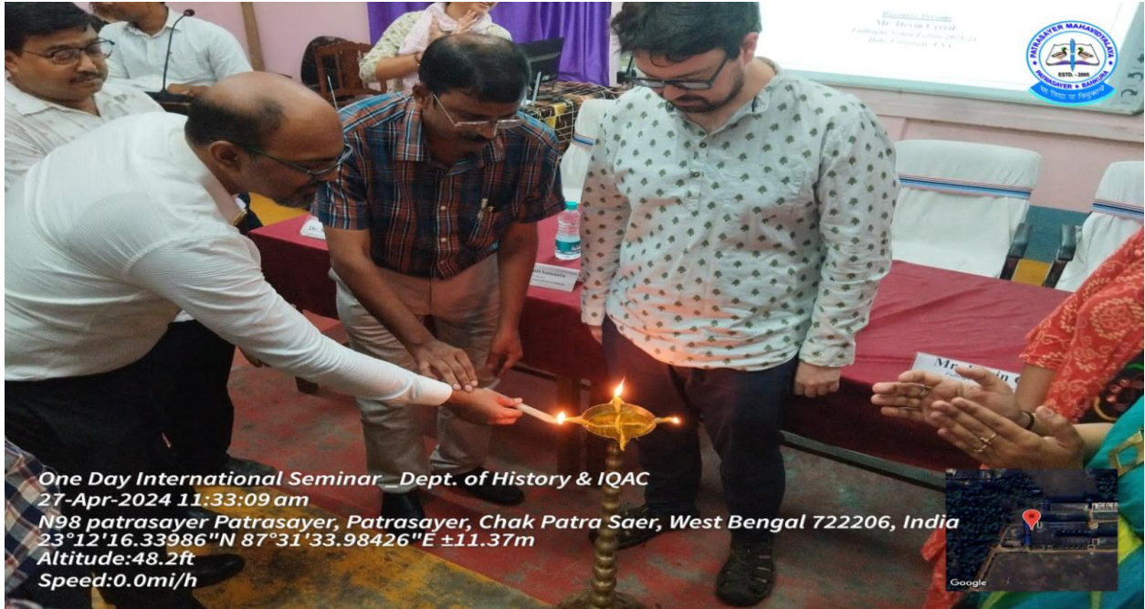
One Day International Seminar _Dept. of History & IQAC 27-Apr-2024 11:33:09 am N98 patrasayer Patrasayer, Patrasayer, Chak Patra Saer, West Bengal 722206, India 23°12'16.33986"N 87°31'33.98426"E ±11.37m Altitude:48.2ft Speed:0.0mi/h