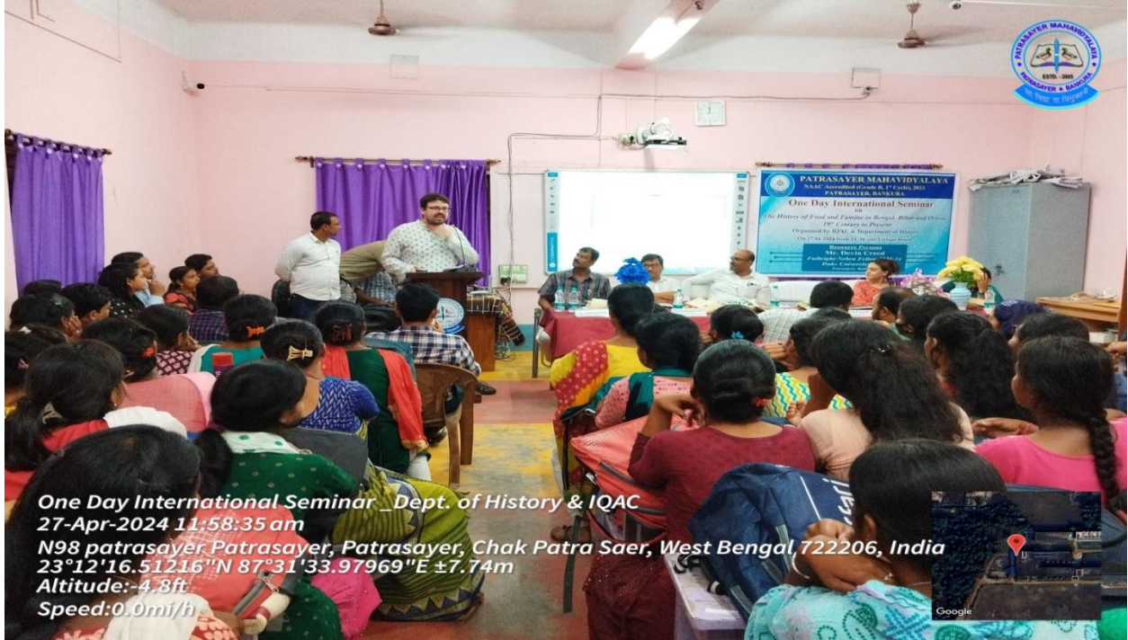
One Day International Seminar Dept. of History & IQAC 27-Apr-2024 11:58:35 am N98 patrasayer Patrasayer, Patrasayer, Chak Patra Saer, West Bengal 722206, India 23°12'16.51216"N 87°31'33.97969"E ±7.74m Altitude:-4.8ft Speed:0.0mi/h