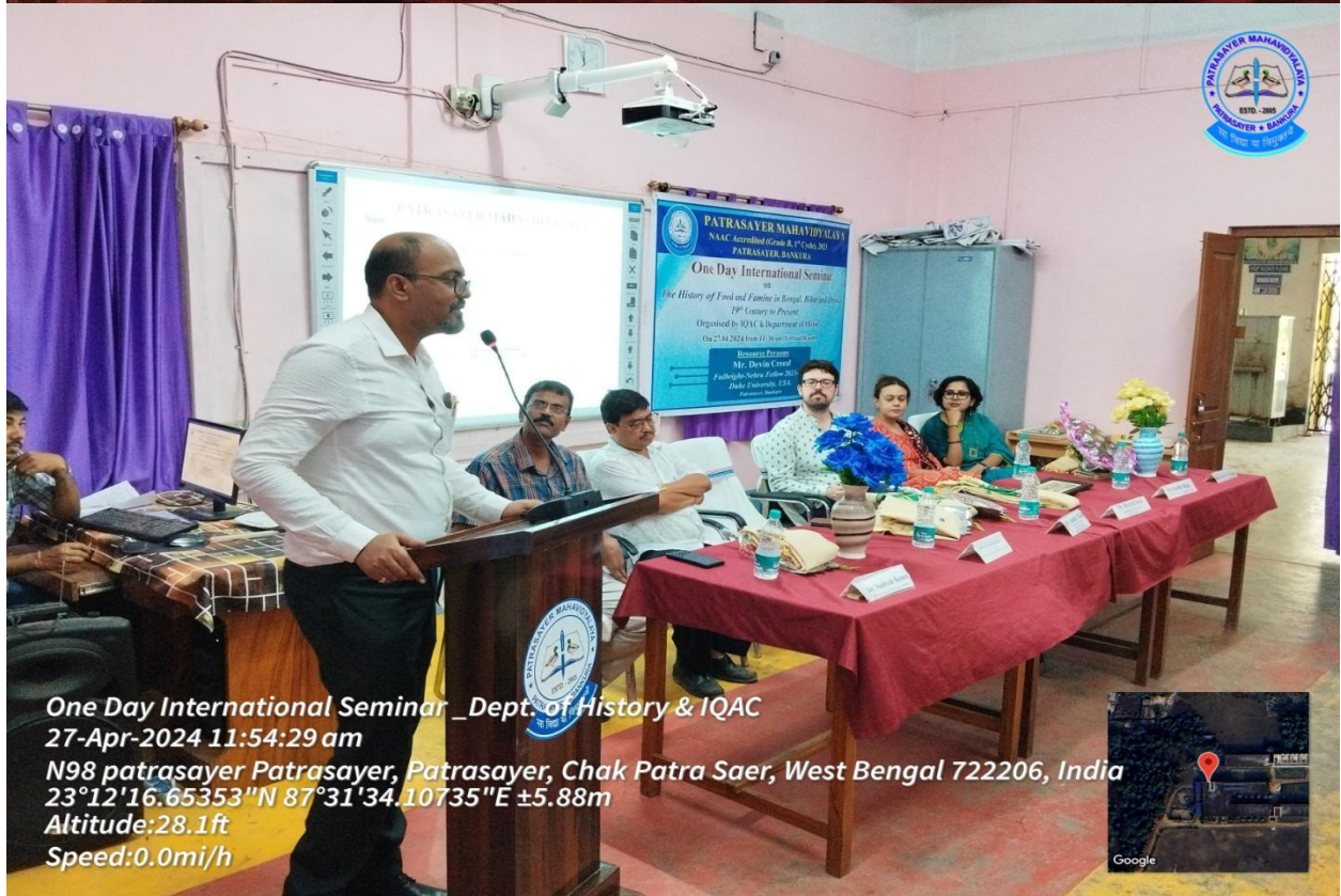
One Day International Seminar Dept. of History & IQAC 27-Apr-2024 11:54:29 am N98 patrasayer Patrasayer, Patrasayer, Chak Patra Saer, West Bengal 722206, India 23°12'16.65353"N 87°31'34.10735"E ±5.88m Altitude:28.1ft Speed:0.0mi/h