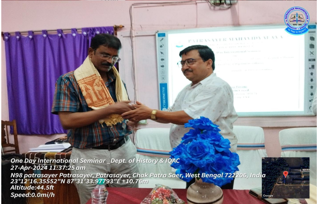
One Day International Seminar Dept. of History & IQAC 27-Apr-2024 11:37:25 am N98 patrasayer Patrasayer, Patrasayer, Chak Patra Saer, West Bengal 722206, India 23°12'16.35552"N 87°31'33.97793"E +10.76m Altitude:44.5ft Speed:0.0mi/h