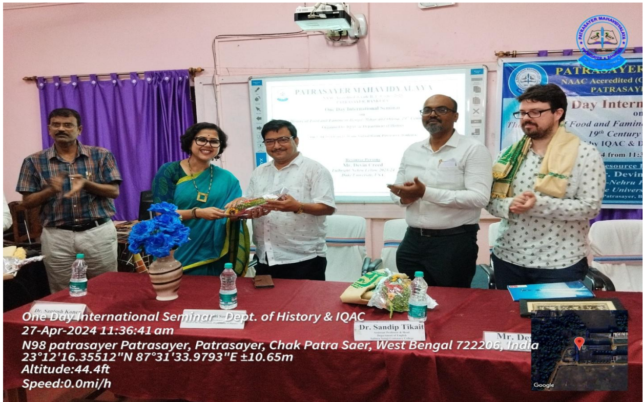
One Day International Seminar Dept. of History & IQAC 27-Apr-2024 11:36:41 am N98 patrasayer Patrasayer, Patrasayer, Chak Patra Saer, West Bengal 722206, India 23°12'16.35512"N 87°31'33.9793"E ±10.65m Altitude:44.4ft Speed:0.0mi/h